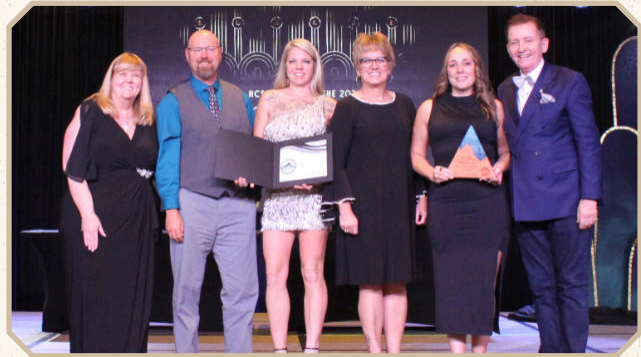
Hospital of Choice - Kiowa County Memorial Hospital, Greensburg, KS

At the Night of Excellence on Wednesday, November 12, 2025, we recognized 115 Pinnacle Achievers and 32 Summit Award Recipients. Congratulations to everyone that participated. Click HERE to see all the details.