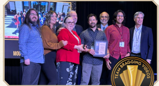
1 st Place - Mountains Community Hospital

Thank you to all facilities who showed their team spirit through these wonderful videos. To see photos, click HERE .